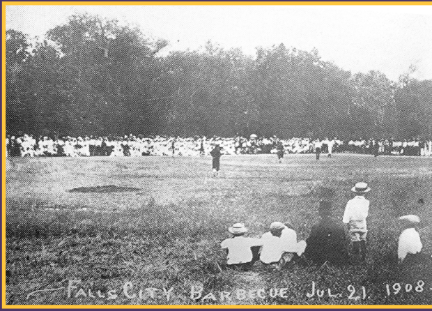
Fall City Picnic 1908 and Falls City Picnic 2024